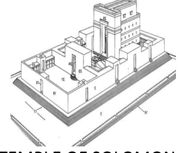
TEMPLE OF SOLOMON